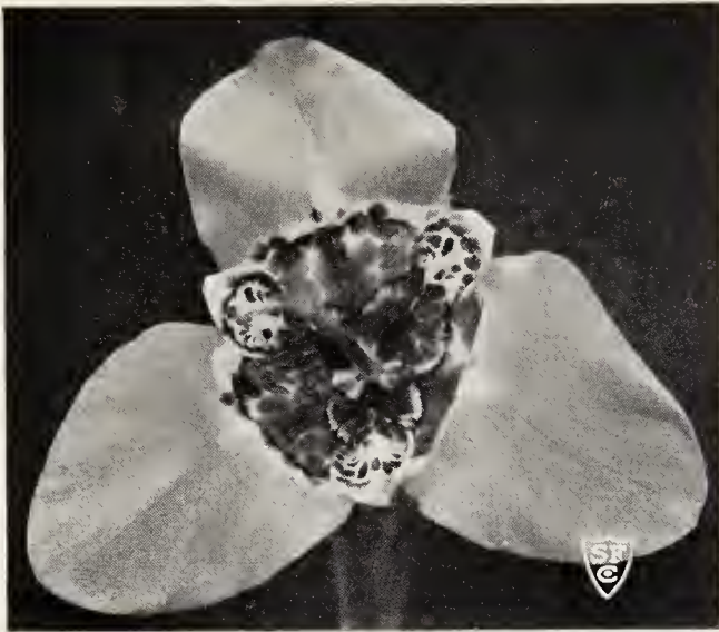
TIGRIDIAS, OR MEXICAN LILY

TIGRIDIAS, or MEXICAN LILY —The strange brilliance and form of this summer flowering bulb is irresistible in its appeal to the eye and sense of mankind. The queer fact of its flowers lasting but one day, yet flowering all summer in great profusion, makes this a desirable bulb for all gardens.